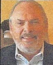
By JIM SMITH Realtor®

home." Across all age groups, 70% or more of homebuyers reported taking into account at least one climate risk when looking for their next home.